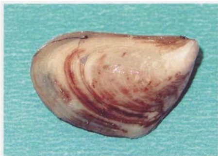
An example of what a quagga mussel looks like (not to scale).

For more information on the Quagga Mussel, visit the California Department of Fish and Game Web site at http://www.dfg.ca.gov/quaggamussel/