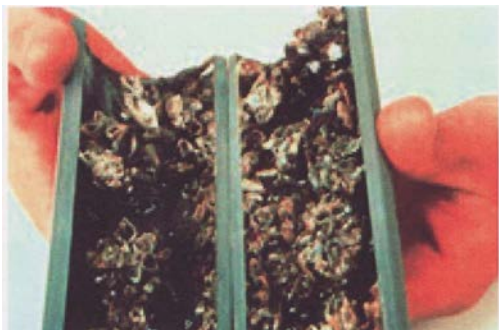
A pipe infested with quagga mussels.