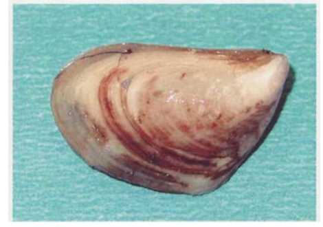
An example of what a quagga mussel looks like (not to scale).

For more information on the Quagga Mussel, visit the California Department of Fish and Game Web site at http://www.dfg.ca.gov/quaggamussel/