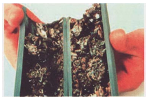
A pipe infested with guagga mussels.