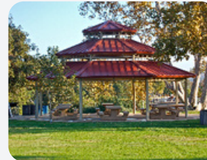
Lake 5 - Gazebo 3