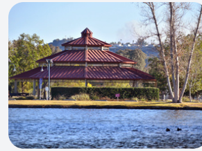
Lake 1 - Gazebo 1